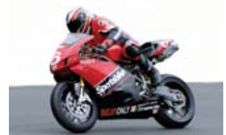
AS USED BY THE SPORTSBIKE RACING TEAM

SEND TO: Sportsbike P.O.Box 1022 Double Bay NSW 2028 AUSTRALIA For assistance Telephone: +61 (02) 9310 0732 or e-mail: info@sportsbike.com.au